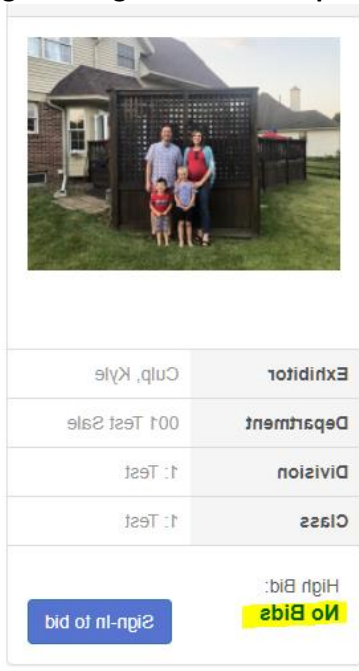
Image 3. Image of sale lots in public view